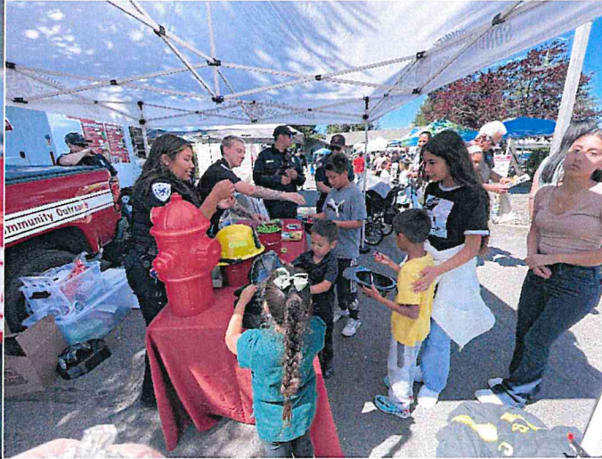
SCFD-EMS at Dia de Los Ninos in Moorland