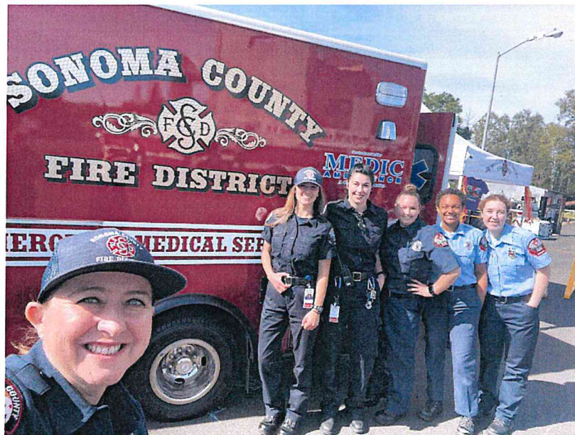
SCFD-EMS at Women in Public Safety Day in Santa Rosa