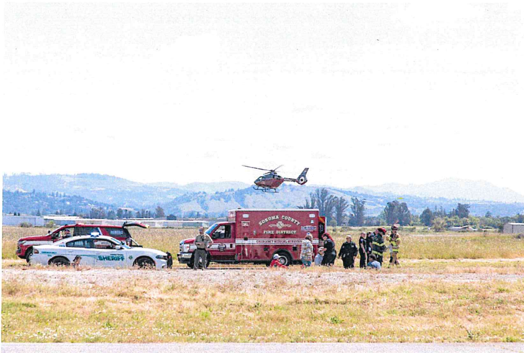
SCFD-EMS at Airport Triennial Exercise